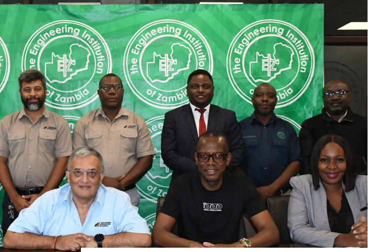
Trackers Association of Zambia representatives, EIZ secretariat and Council after signing an MOU to increase registration of skilled people.