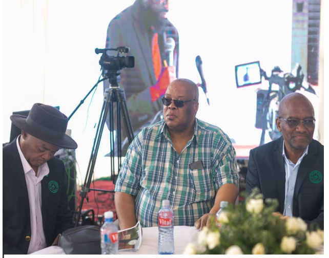
Past Presidents and senior engineering professionals at the official opening of the Northern Region office building.