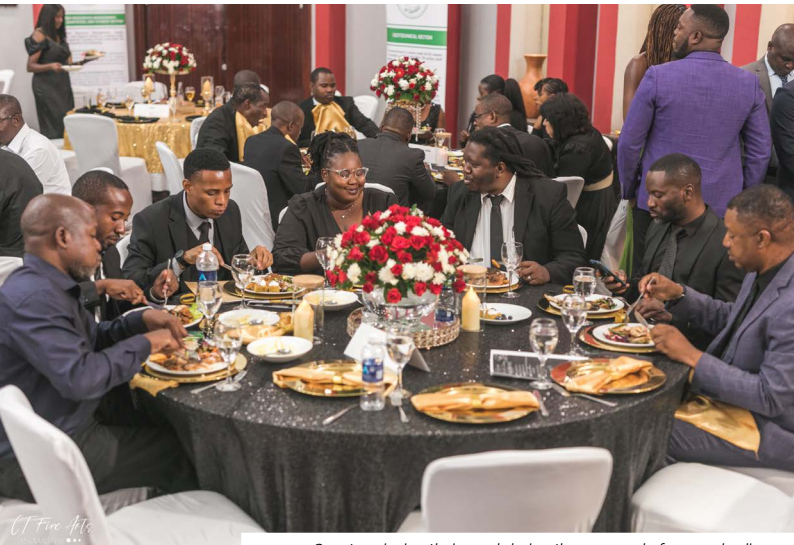
Guests enjoying their meal during the 2023 end of year gala dinner.