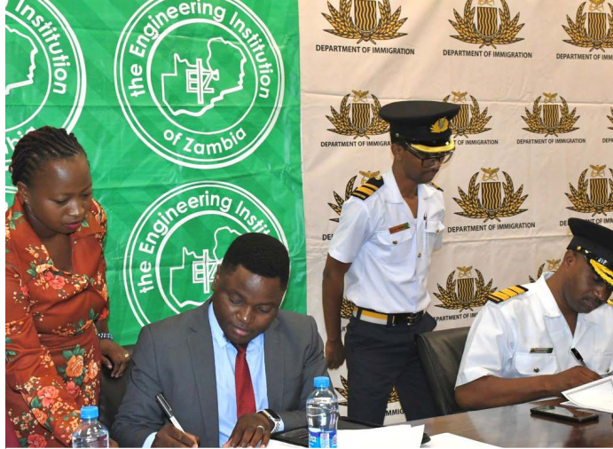
Signing of the MoU between EIZ and Department of Immigration to scrutinize qualifications of foreign engineering professionals.