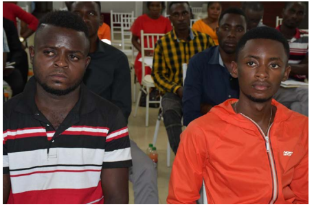
Members of the Kabwe branch following the proceedings during the forum

And making a presentation on engineering and financial planning at the same event,